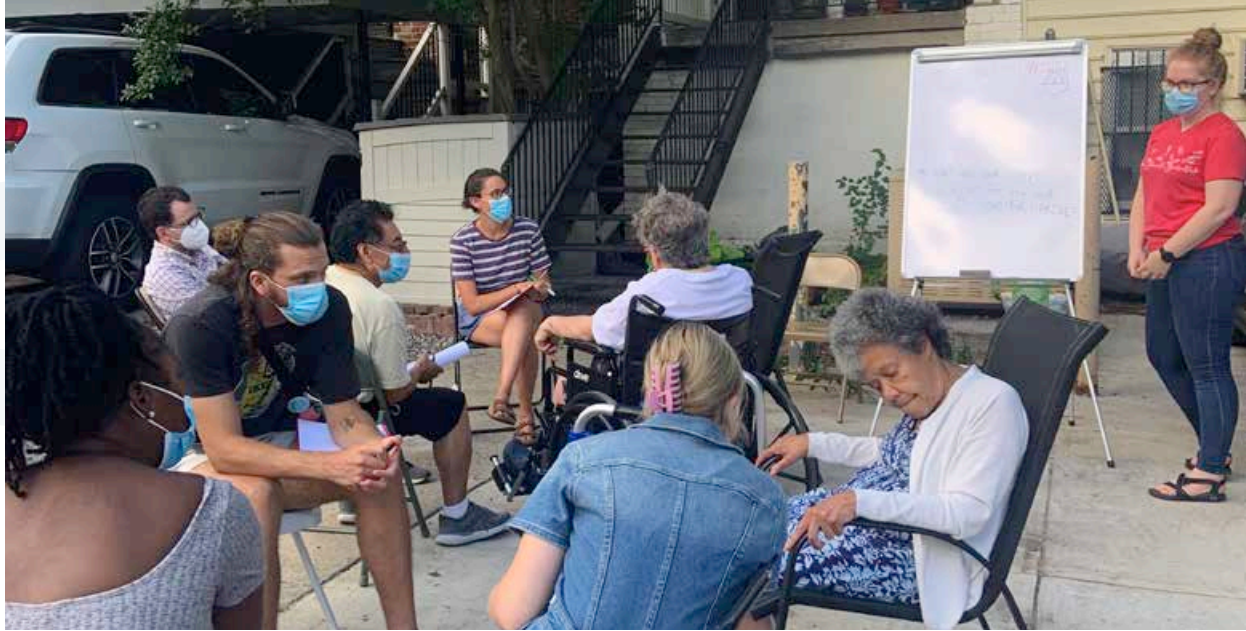
Ontario House, Euclid House, and other DC community members gathered to share their thoughts for the mandate