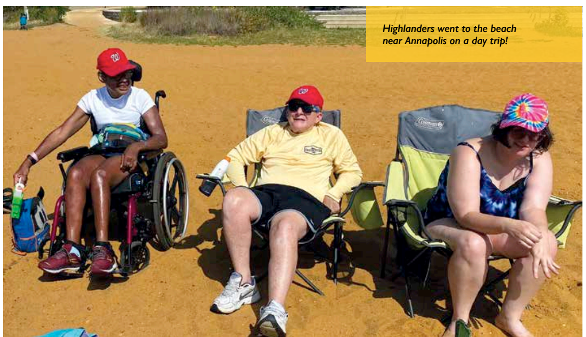
Highlanders went to the beach near Annapolis on a day trip!