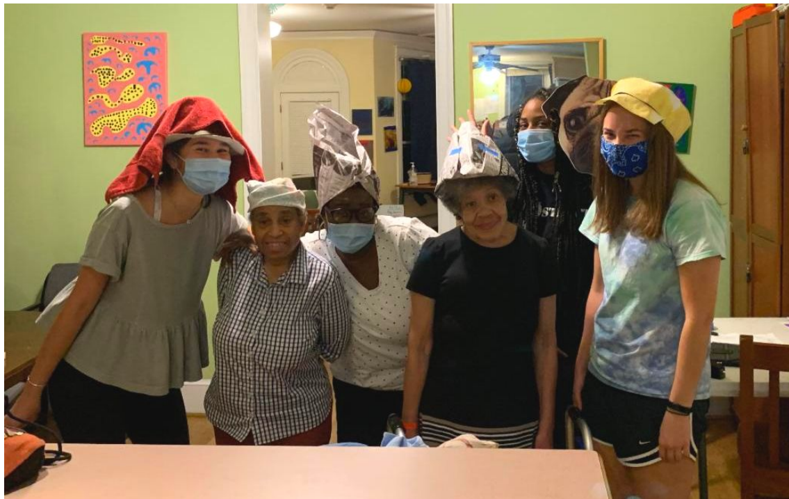
Ontario House celebrated National Hat Day in style!

L'ARCHE GREATER WASHINGTON, D.C. PO BOX 21471 Washington, DC 20009