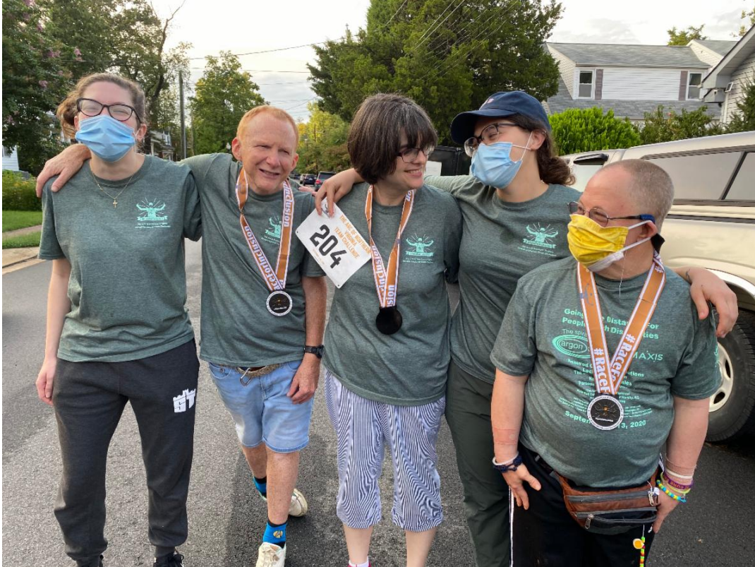
Highland House enjoys walking together!