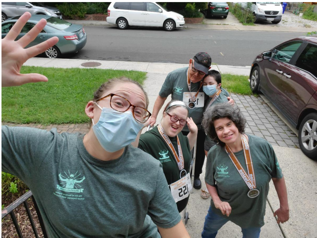
We love to get outside, get moving, and support our friends at the Arc. 6th Street poses together for their walk!