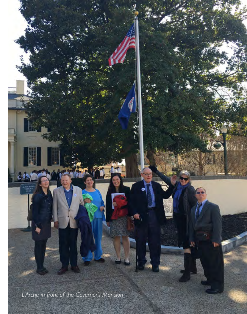
L'Arche in front of the Governor's Mansion