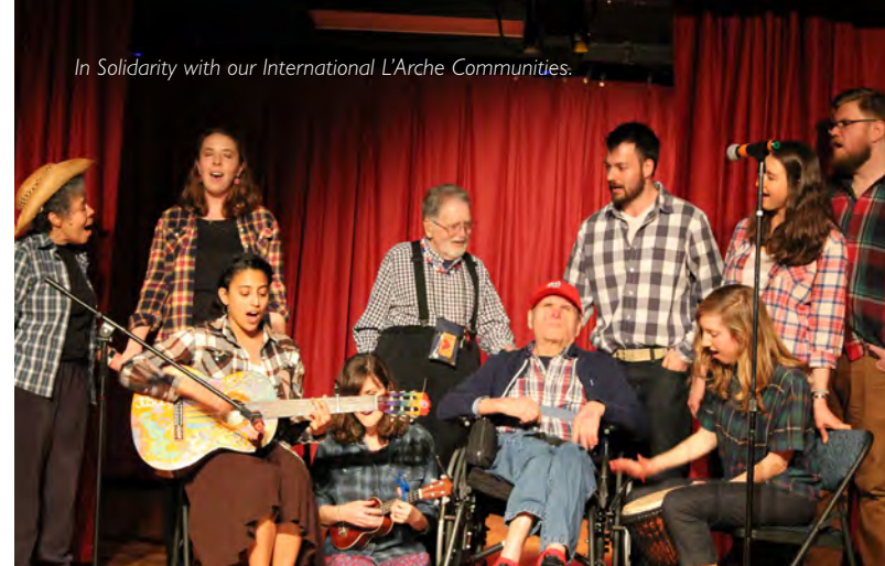
In Solidarity with our International L'Arche Communities.