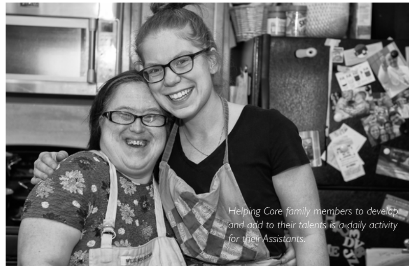
Helping Core family members to develop and add to their talents is a daily activity for their Assistants.