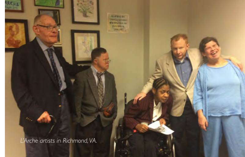
L'Arche artists in Richmond, VA.