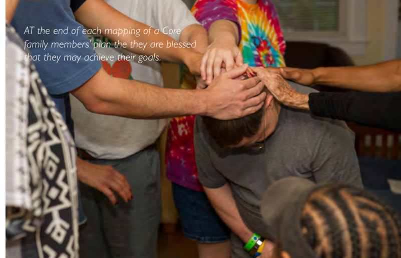
At the end of each mapping of a Core family members plan the they are blessed that they may achieve their goals.