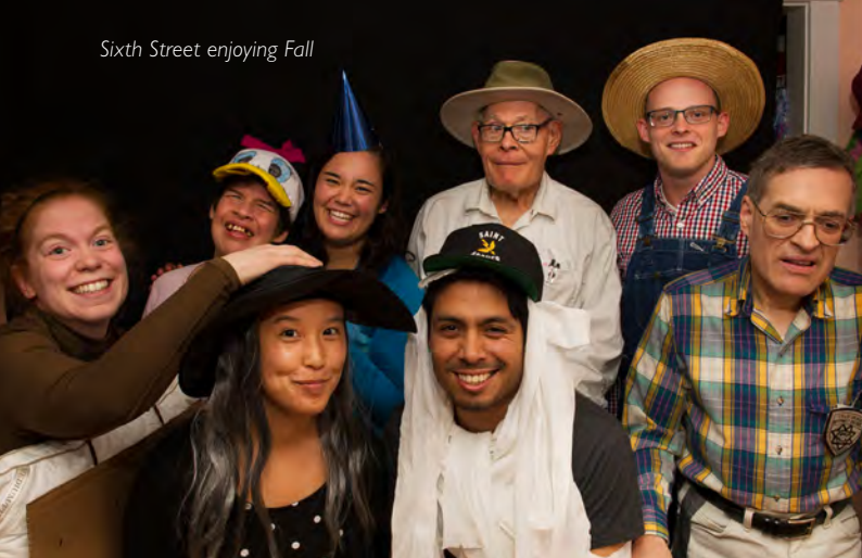
Sixth Street enjoying Fall