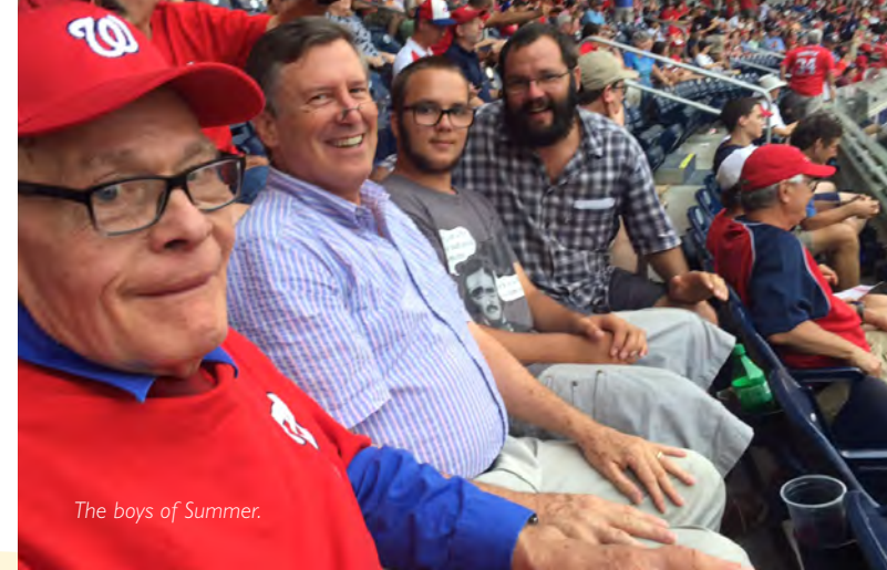
The boys of Summer.