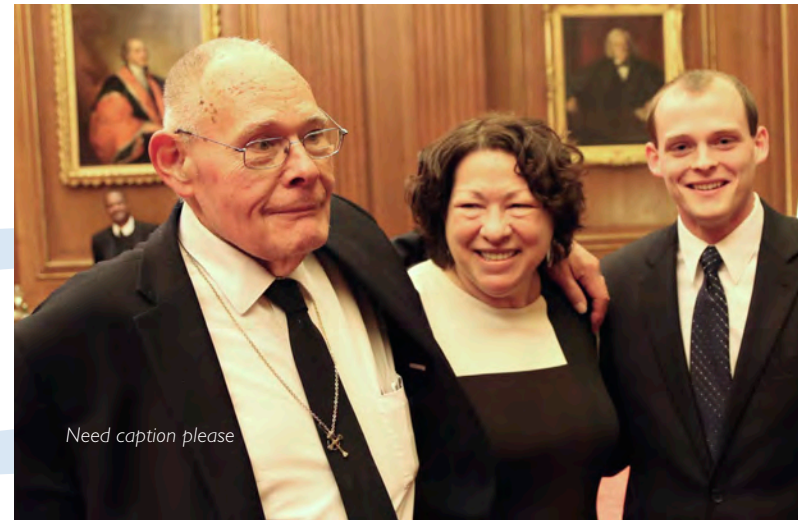
Need caption please