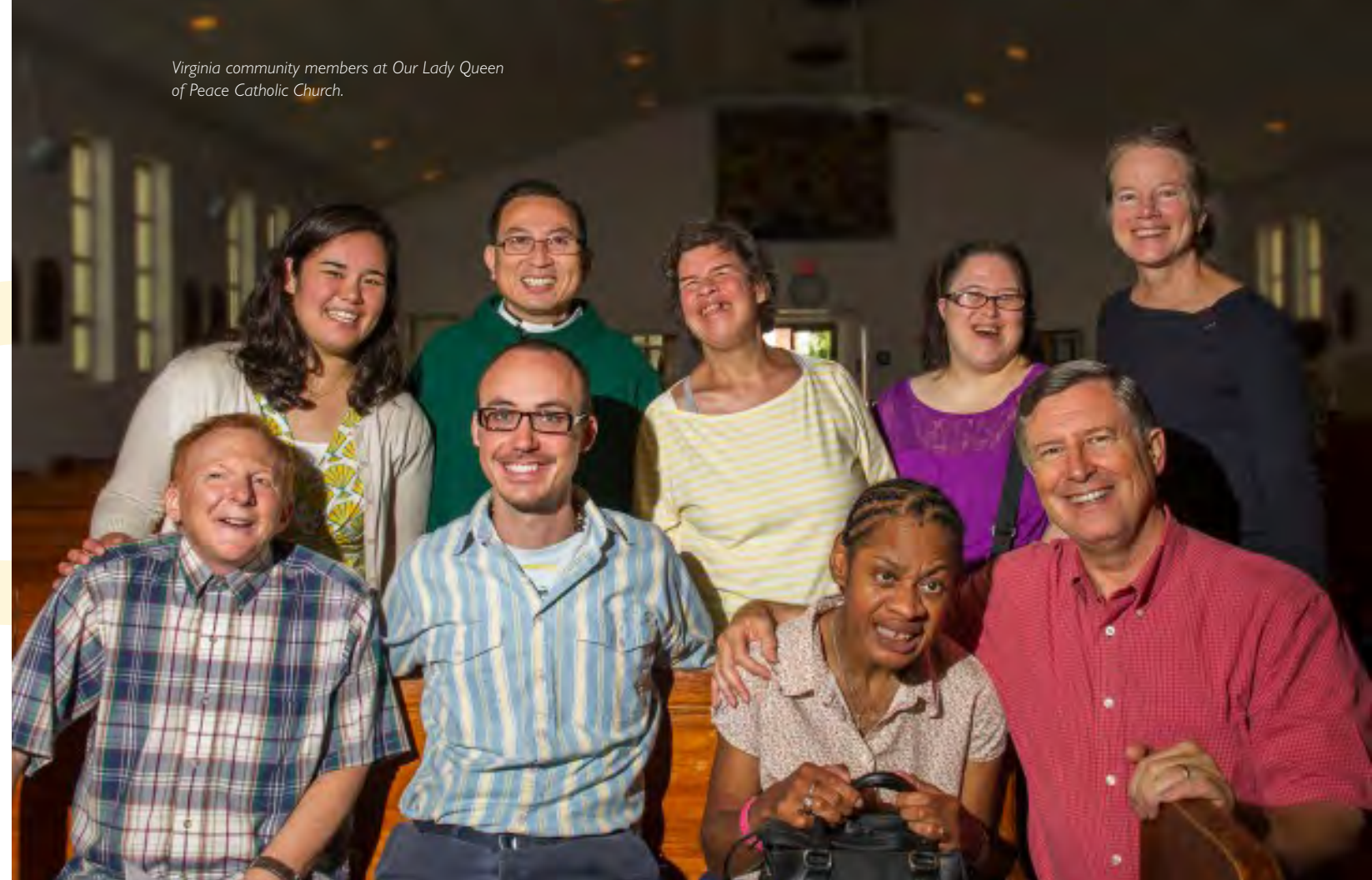
Virginia community members at Our Lady Queen of Peace Catholic Church.