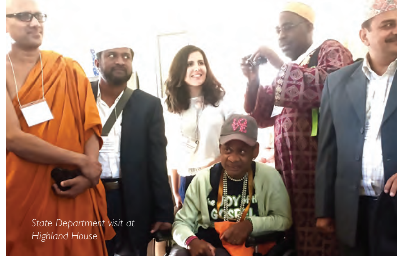
State Department visit at Highland House