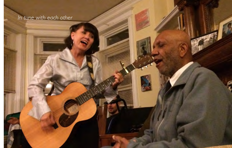
In tune with each other