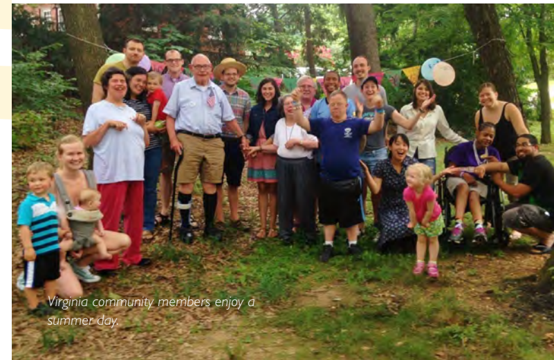
Virginia community members enjoy a summer day.