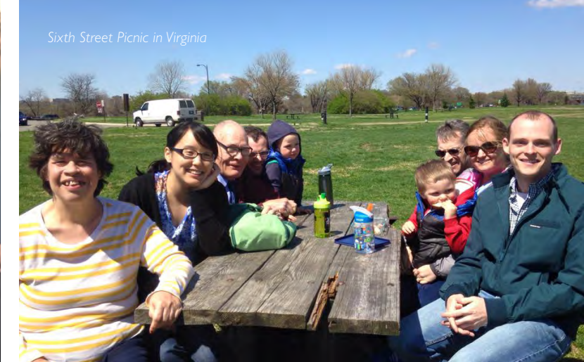
Sixth Street Picnic in Virginia