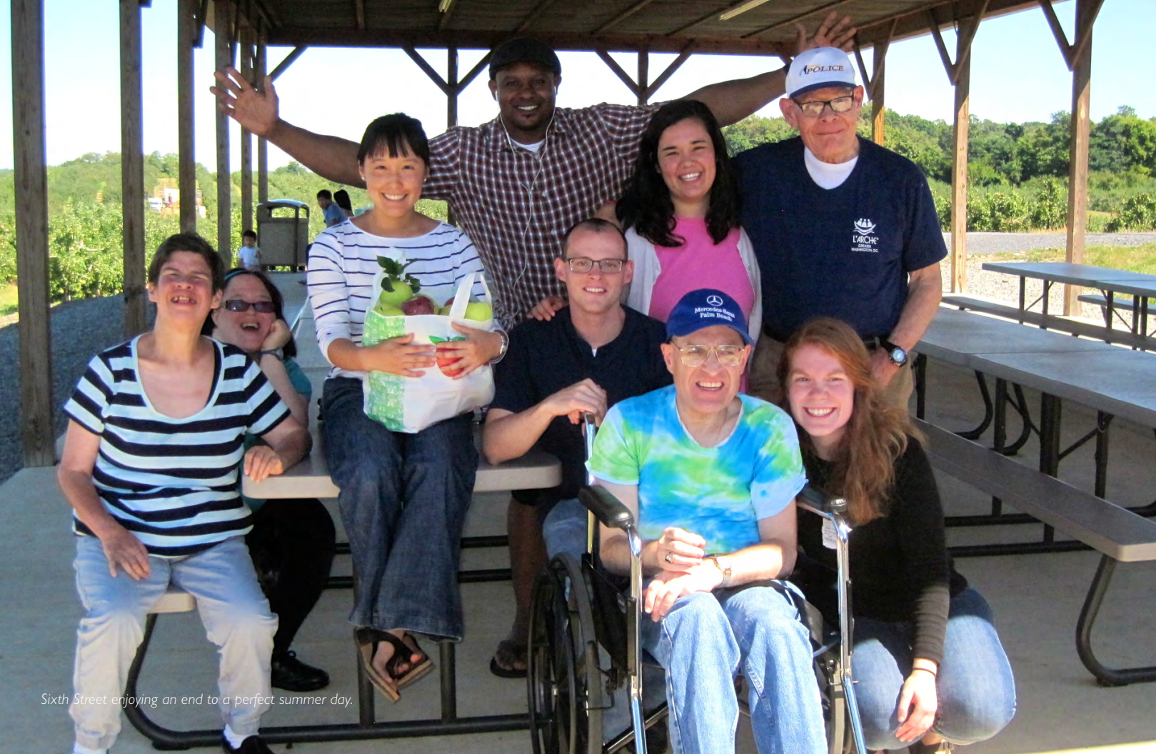
Sixth Street enjoying an end to a perfect summer day.