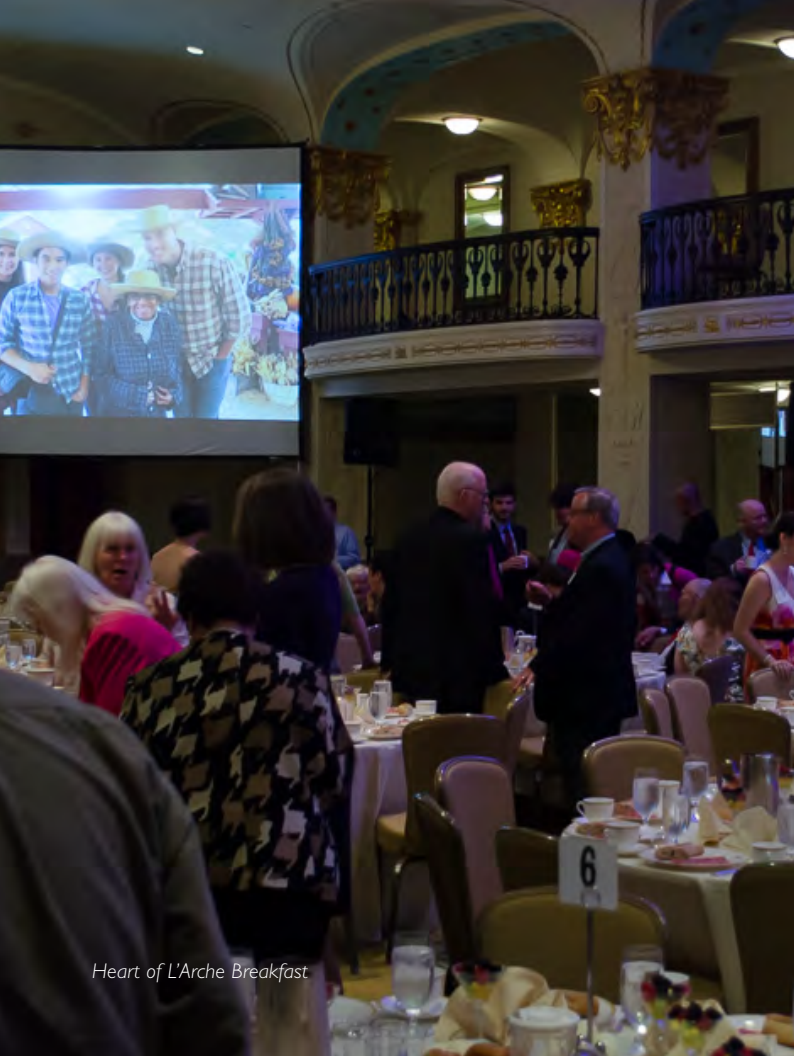
Heart of L'Arche Breakfast