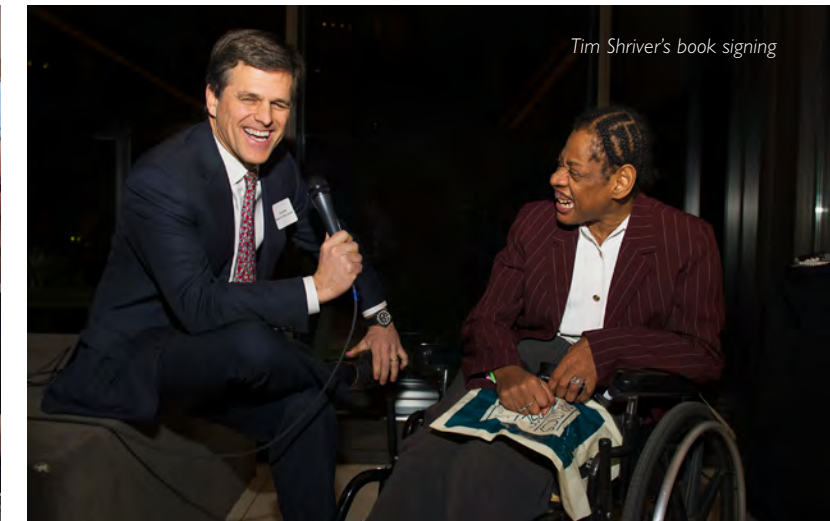
Tim Shriver's book signing